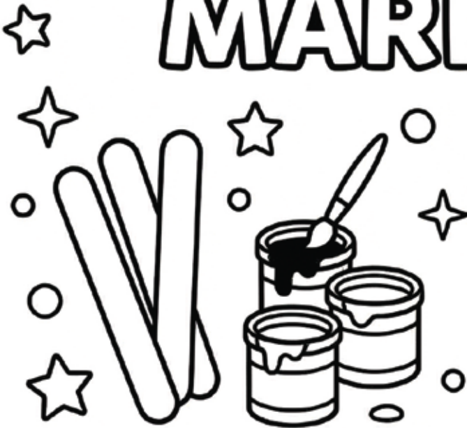
1. GET STICKS & PAINT