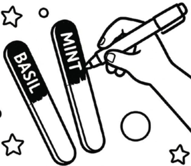
3. WRITE NAMES