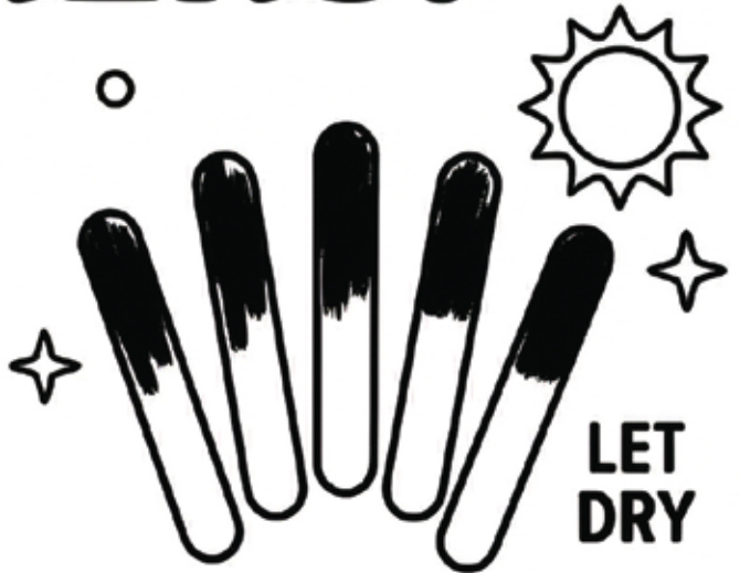
2. PAINT TOP HALF