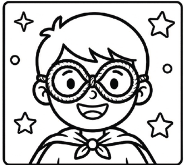
4. WEAR & PLAY!

COOL INFO: These masks encourage imaginative play and help kids create their own superhero identities!