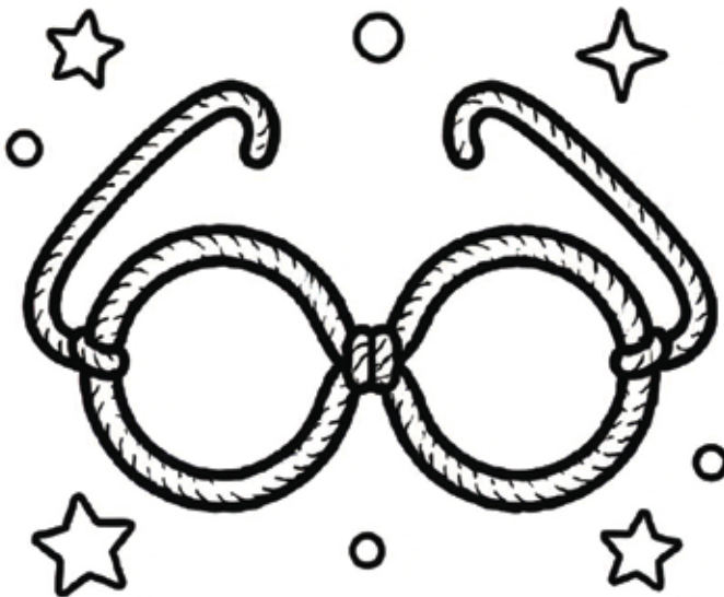
3. ADD EAR HOOKS