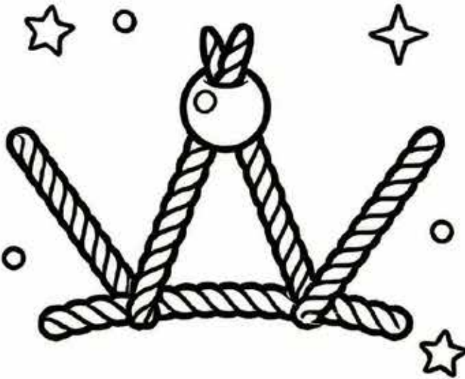
3. ADD JEWELS