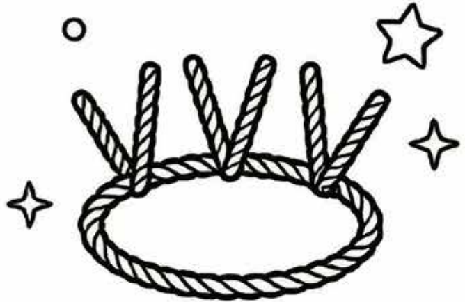
2. ADD THE POINTS