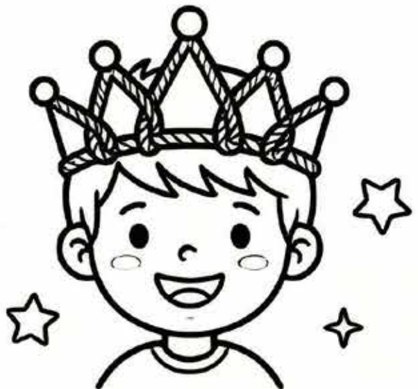
4. WEAR YOUR CROWN!

COOL INFO: Use different colors of pipe cleaners and beads to make your crown unique and sparkly!