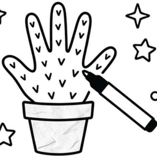
3. DRAW SPIKES