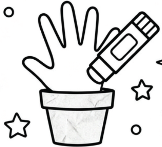
2. GLUE TO A POT