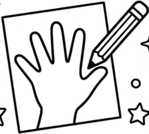
1. TRACE & CUT OUT