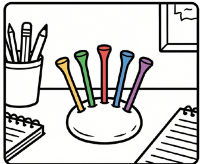
4. HOLD SPARE TEES ON DESK!

DID YOU KNOW? Before the modern wooden golf tee was invented in 1899, golfers used to build little mounds of wet sand to hold their balls up for the first shot!