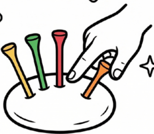
2. PRESS IN 5 OR 6 GOLF TEES