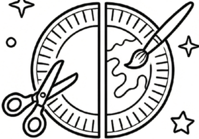
1. CUT & PAINT PLATE HALF