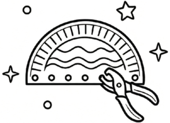
2. PUNCH HOLES ON EDGE