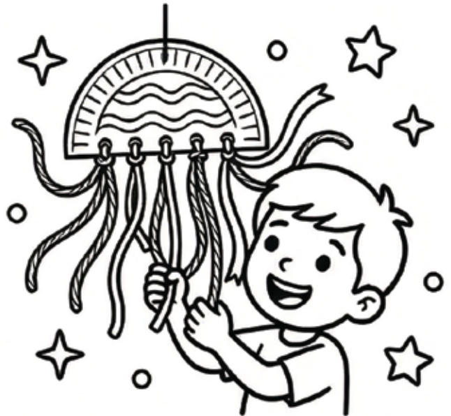
4. HANG & ENJOY!

COOL INFO: Jellyfish don't have brains, hearts, or bones! They use their long tentacles to catch food in the ocean.