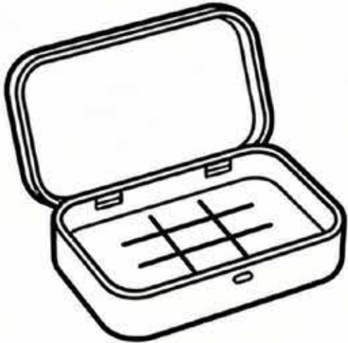
1. PAINT THE GRID