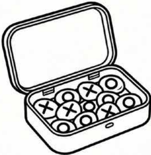
3. PACK THE TIN